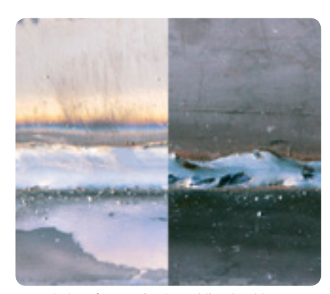
Descaled surfaces prior to welding lead to clean welding seams