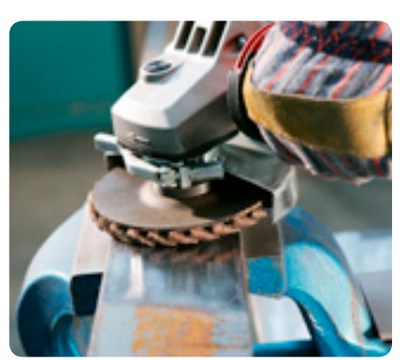
Professional derusting and descaling